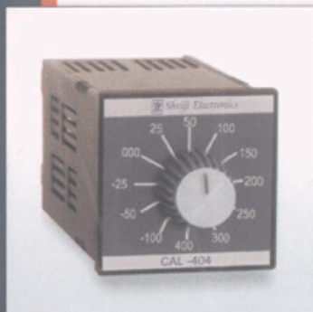
CAL 404 / 405