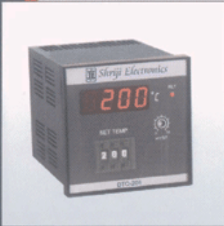
DTC-201 / 221

• User selectable range possible • 2 c/o Relay O/P one for 20 Amp, Two for 6 Amp. (Only 96 x 96 mm)