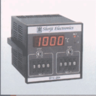
DTC - 204