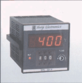
DTC - 201P / 221 P